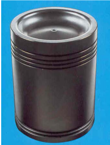
Cast iron, 250 mm. dia. X 400 mm. high