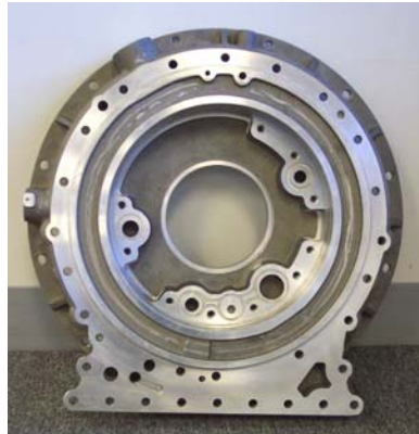
Aluminum 356 T-6, 500 mm dia. O.D., 125 mm I.D.