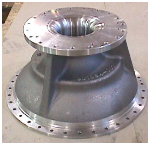
Stainless Steel, 300 mm. dia. X 200 mm. high