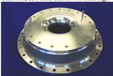
Stainless Steel, 250 mm. dia. X 75 mm high